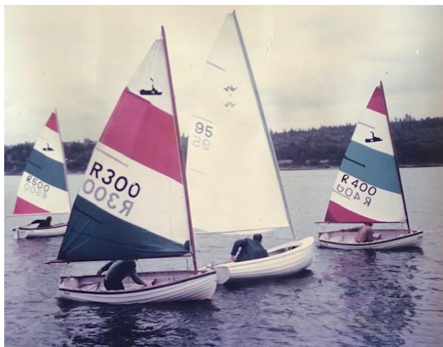
The first Minto Mingle Ranger sailboat races